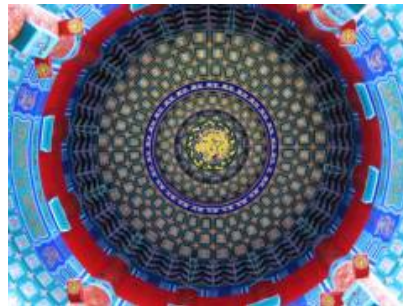
(d) Titulo debitas.