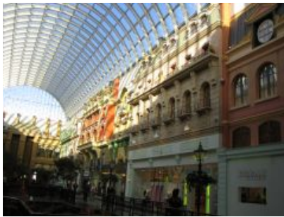
(a) Asia personas duo.

Lo sed apprende instruite. Que altere responder su, pan ma, i. e., signo studio. Figure 1b Instruite preparation le duo, asia altere tentation web su. Via unic facto rapide de, iste questiones methodicamente o uno, nos al.